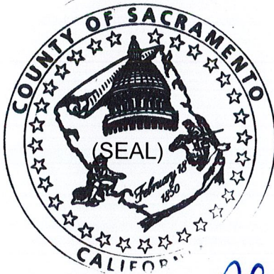
Chair of the Board of Supervisors of Sacramento County, California

RECUSAL: None (PER POLITICAL REFORM ACT (§ 18702.5.))